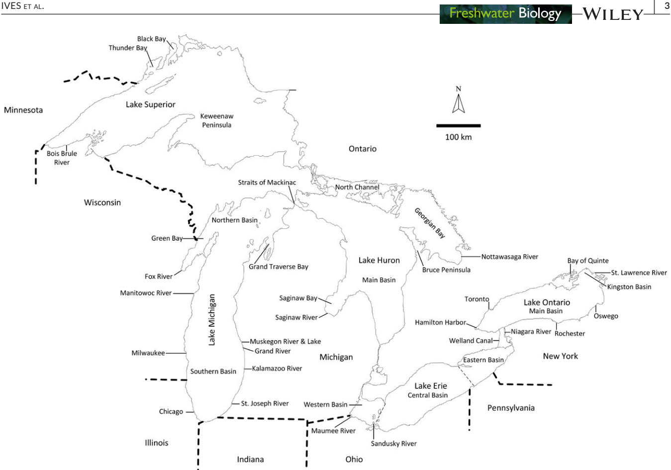
FIGURE 1 Map of Great Lakes basin locations mentioned in text