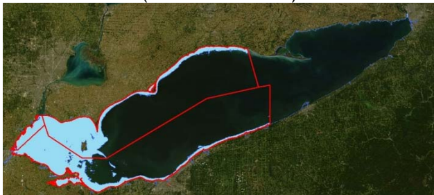
Figure 3. Present quota sharing allocation (≤ 13m; light blue) by jurisdiction (red).

increased in shallower, warmer and more turbid waters. In general, the west basin had more suitable habitat than the east basin. There was less habitat in epibenthic waters compared to subsurface waters in the east, but there was little difference in the west. This research was published in the Journal of Great Lakes Research (Pandit et al. 2013).