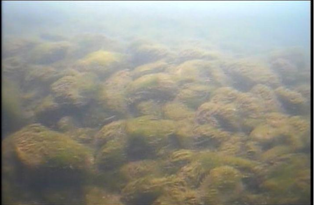
Figure 2. Underwater photo of bottom habitat off 18 Mile Creek in Lake Erie, July 2011

Underwater video surveys revealed a potential high quality lake trout spawning area off Eighteen Mile Creek (Figure 2). This nearshore site is relatively large and appears to possess many of the necessary attributes that lake trout need for successful reproduction, including cobble sized rock piles, a substrate relatively clean of silt, and large interstitial spaces. However, it is subject to the strong westerly winds and waves that buffet the area during fall and winter months. Since this site is shallow and closer to the eastern end of the lake, it often becomes ice covered during winter, potentially diminishing some of these effects.