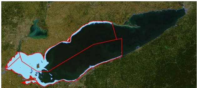
Figure 3. Present quota sharing allocation ( \leq 13m; light blue) by jurisdiction (red).

and environmental variable linked datasets (Ontario Partnership Index Gillnet). Consistent with the literature, the probability of encountering walleye increased in shallower, warmer and more turbid waters. In general, the west basin had more suitable habitat than the east basin. There was less of habitat in epibenthic waters compared to subsurface waters in the east, but there was little difference in the west. In 2012, a manuscript (Pandit et al.) was accepted for publication in the Journal of Great Lakes Research .