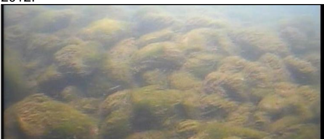
Figure 2. Underwater photo of bottom habitat off 18 Mile Creek in Lake Erie, July 2011.

Additional sidescan data collection occurred at Hoover Point East in 2011, identifying more potential lake trout spawning sites on the southern end of the point (Figure 1). Reconnaissance survey work was started at the Maitland Ridge, located east of previously investigated shoals. This large (15 x 25 km) feature appears to covered with mostly sandy substrates, although bad weather forced the survey to be reduced. Further investigation is planned for 2012.