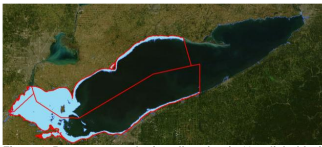
Figure 3. Present quota sharing allocation (≤ 13m; light blue) by jurisdiction (red).

With the assistance of the Walleye Task Group and lead by researchers at the University of Windsor, we utilized a logistic regression approach (Pandit et al.) to establish the relationships between a variety of abiotic conditions and the probability of occurrence of walleye (presence / absence) from a set of fishery and environmental variable linked datasets (Ontario Partnership Index Gillnet). This species-habitat model for adult walleye uses environmental variables that were not only deemed appropriate for walleye but also for which datasets currently exist and provide somewhat broad-scale (location and time) coverage, including temperature, dissolved oxygen, and light attenuation (Secchi depth). Consistent with the literature, the probability of